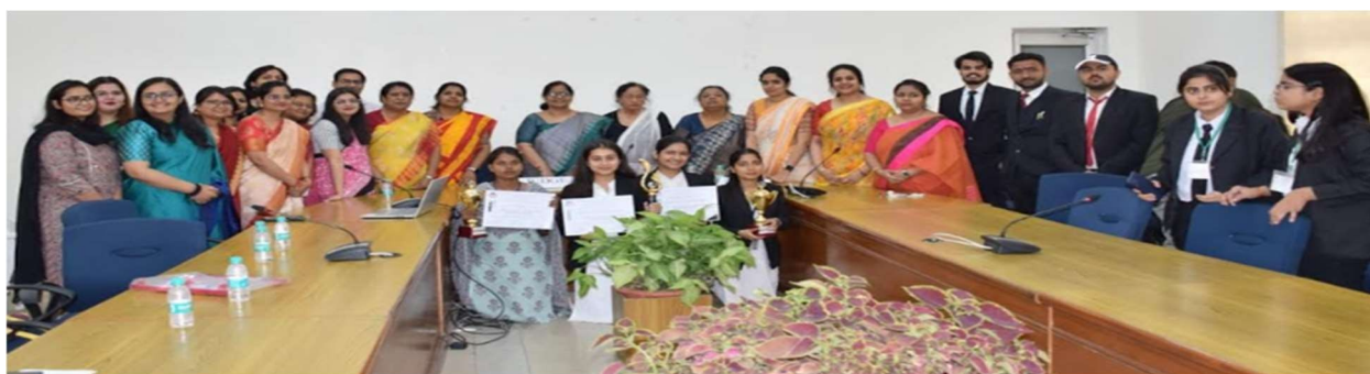
Saroj Lalji Mehrotra Centre of Legal Studies organised its first Inter-Collegiate Bilingual Politico-legal Debate Competition, Prativaad on 13.04.2023