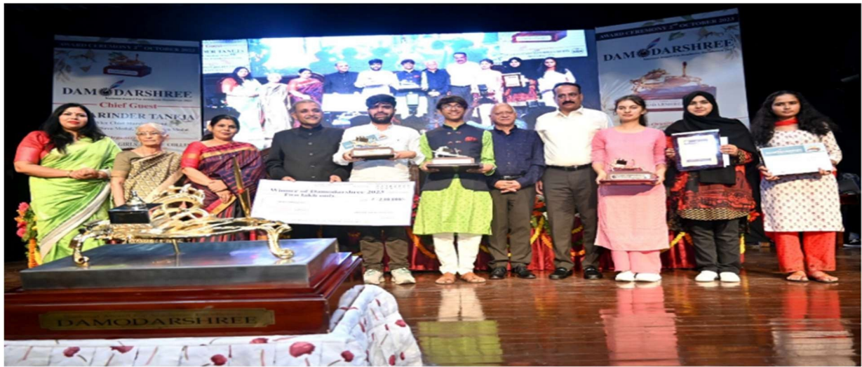
Damodarshree National Essay Competition, 02.10.2023