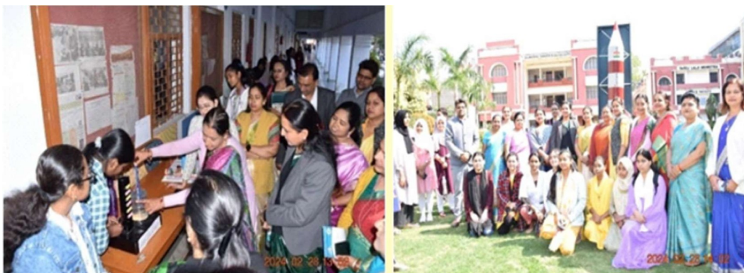
Celebration of National Science Day on 28.02.2024