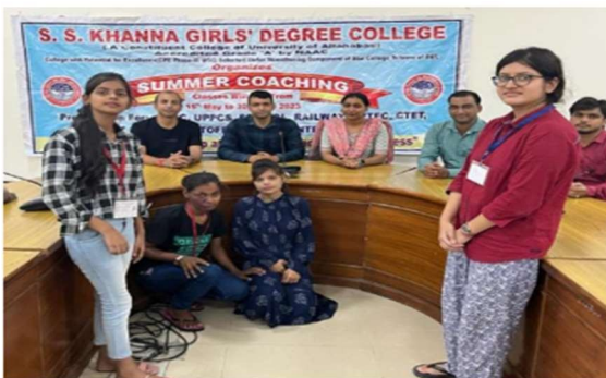
A month-long free Summer Coaching Programme commenced on 15.05.2023