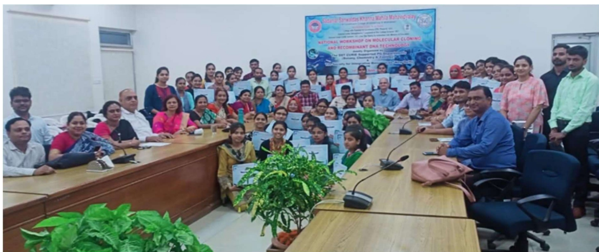
Two-day National Workshop on Molecular Cloning and Recombinant DNA Technology, jointly organized by the Society for Integrative Biosciences and S.S. Khanna Girls' Degree College on 14-15.09.23