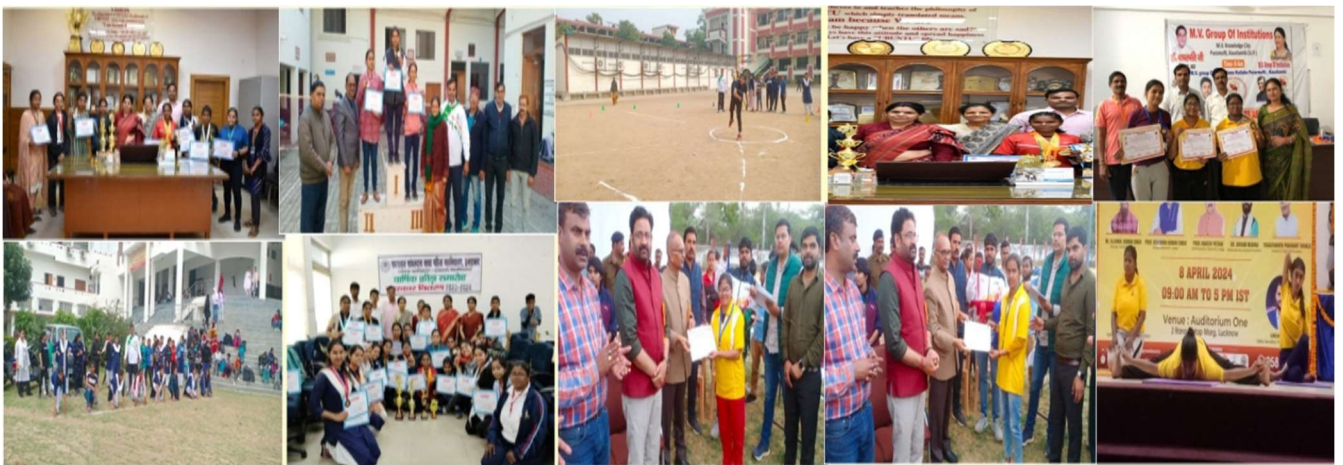
Sports Competition was organised on 15.02.2024