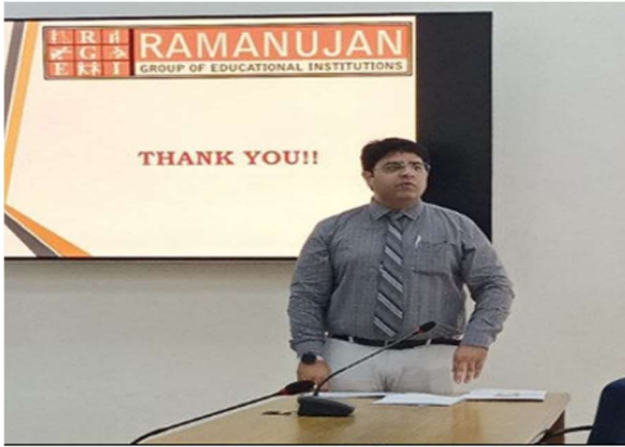
Team from Ramanujam School came to college on 27.06.2023 for a Campus Placement Drive, organized by B.Ed. Faculty