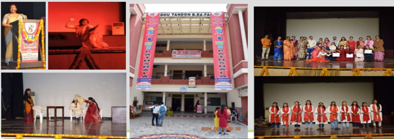
A Two-day event “The National Level Cultural and Art Youth Festival: Masti Ki Pathshala 2024” was organised by B.Ed. Faculty on 22-23.02.2024