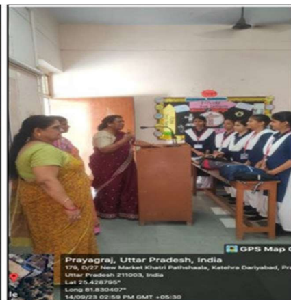
Hindi Diwas celebration was organised in B.Ed. Faculty on 14.09.2023