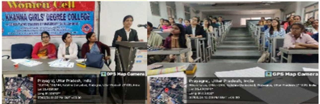
Celebration of International Women’s Day on 07.03.2024