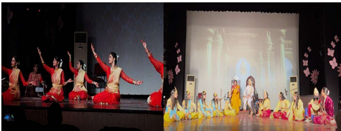
The first anniversary of theatre club, Parizaad and literary & oratory club, Clique, under Saroj Lalji Mehrotra Centre of Legal Studies was celebrated on 25.08.2023