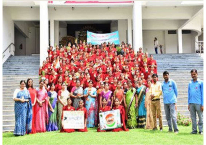
Awareness Rally & Plantation Drive was organised by B.Ed. Faculty on 11.08.2023