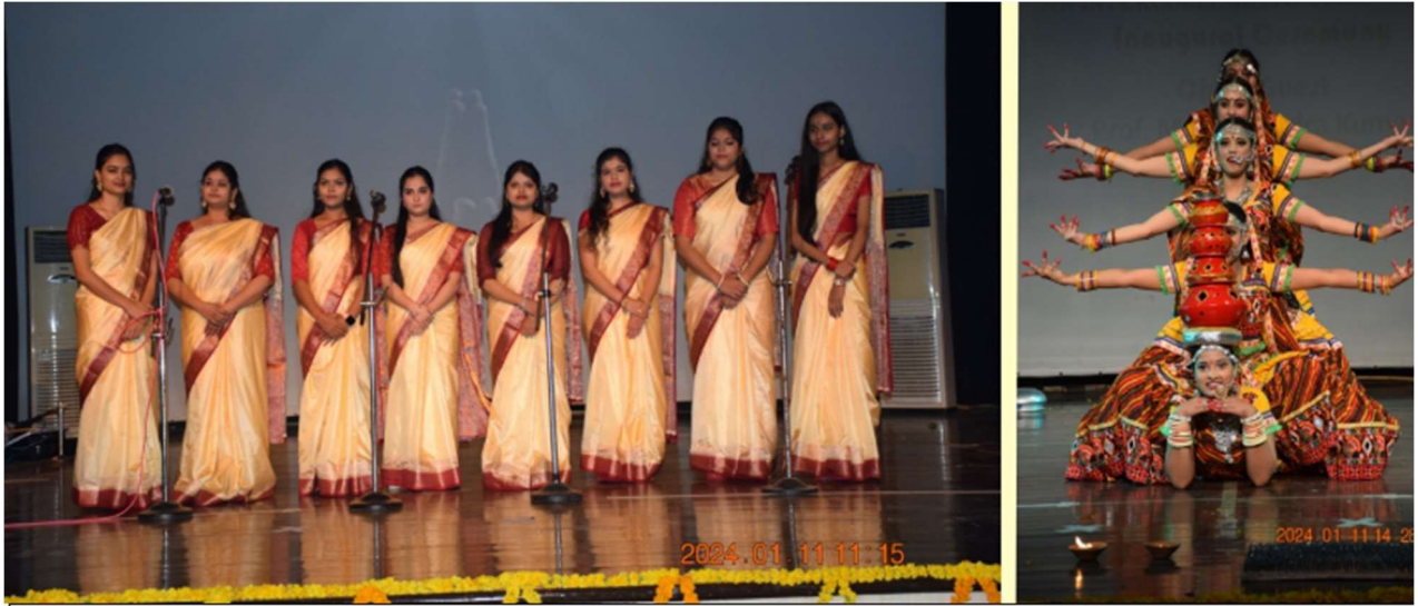
An Intercollegiate Competition, Gyanotsav, under the aegis of IQAC and Academic Cell was organised on 11-12.01.2024