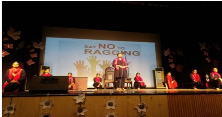
Anti-Ragging Week Celebration from 12.08.2023 to 18.08.2023