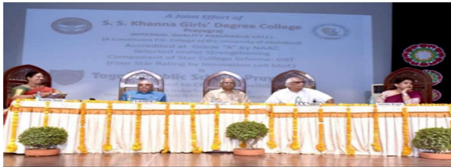
One-day Seminar organized by Harmony (a joint effort of management and faculty members of S.S. Khanna Girls' Degree College, Prayagraj and Tagore Public School, Prayagraj) on 29.04.2023