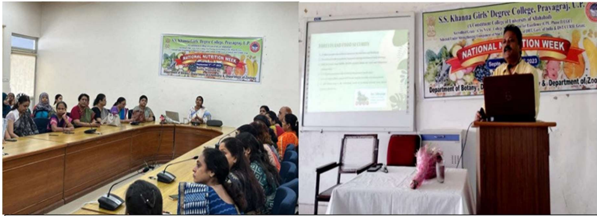
National Nutrition week was jointly celebrated by the Department of Chemistry, Botany and Zoology under the aegis of Strengthening component of star college scheme: DBT from 01-07.09.23