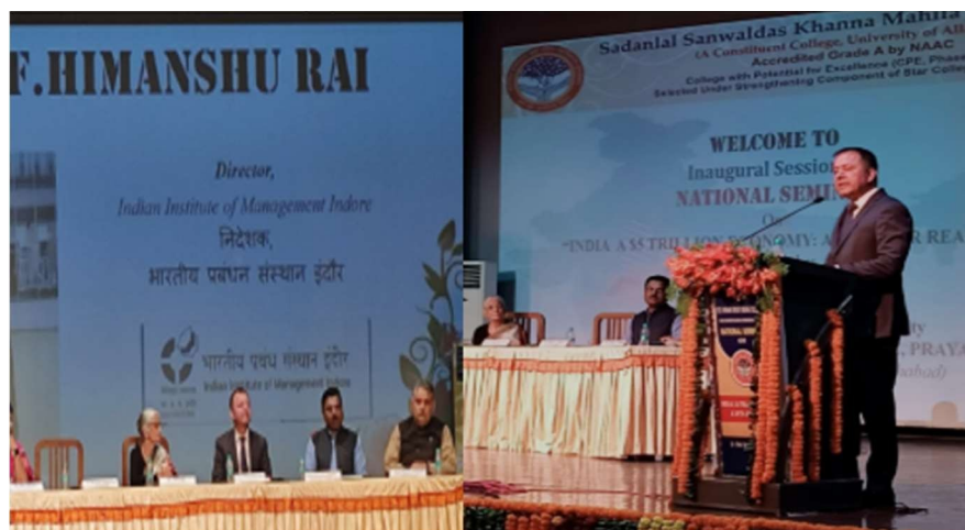
Two-day National Seminar "India a $5 Trillion Economy: A Myth or Reality" was organised by Faculty of Commerce on 08.12.2023