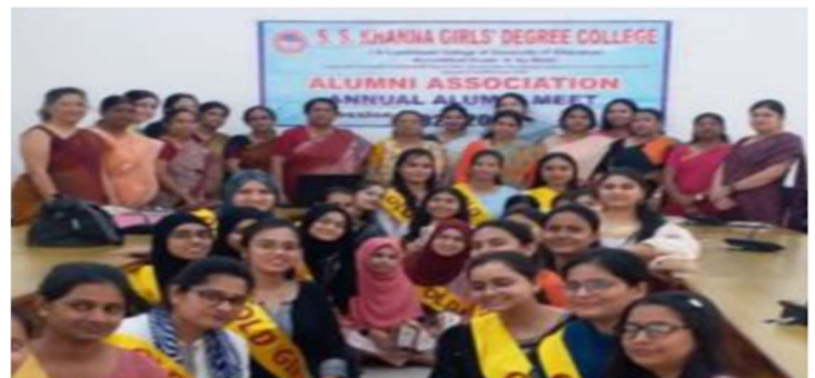
Alumni Meet organised by by Alumni Committee, on 16.05.2023